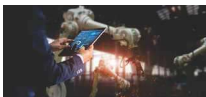
AUTOMATION & ROBOTICS