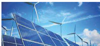
ENERGY, ENVIRONMENT & EV TRANSPORTATION