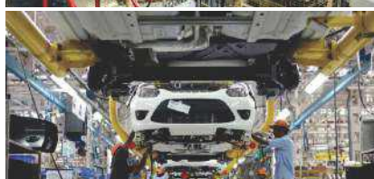
AUTO COMPONENTS & GENERAL ENGINEERING